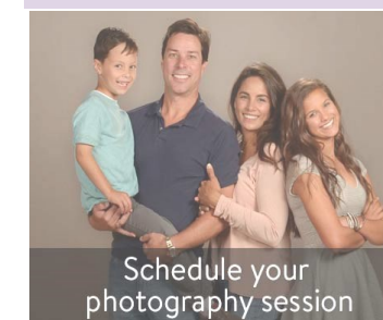
Schedule your photography session

Our member site URL: https://booknow-lifetouch.appointment-plus.com/yqlr8314/